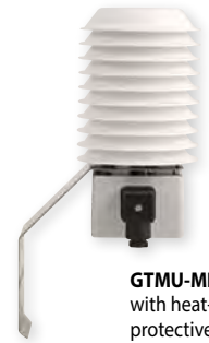
GTMU-MP-SHUT with heat- protective shield