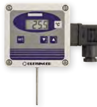
GTMU-MP-AP3 indoor / outdoor probe for direct wall mounting Standard type: FL = 50 mm, D = 3 mm