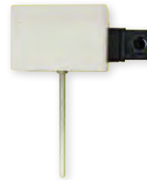
GTMU-MP-AP4 duct probe Standard type: FL = 100 mm, D = 6 mm