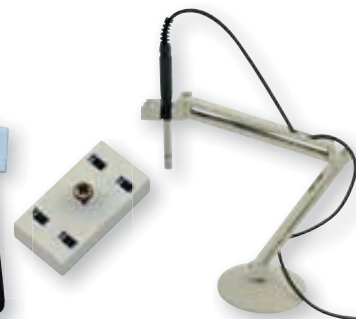
GEH 1 with probe