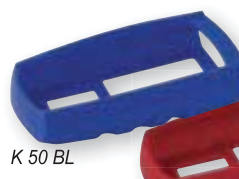
K 50 BL