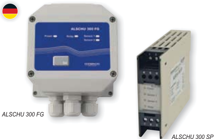
ALSCHU 300 FG