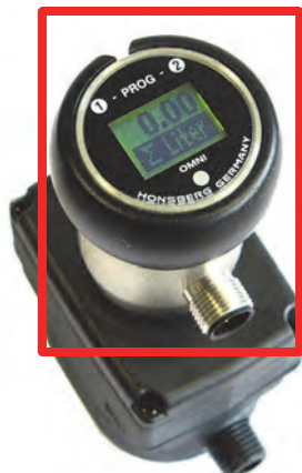
Counter for flow transmitters: